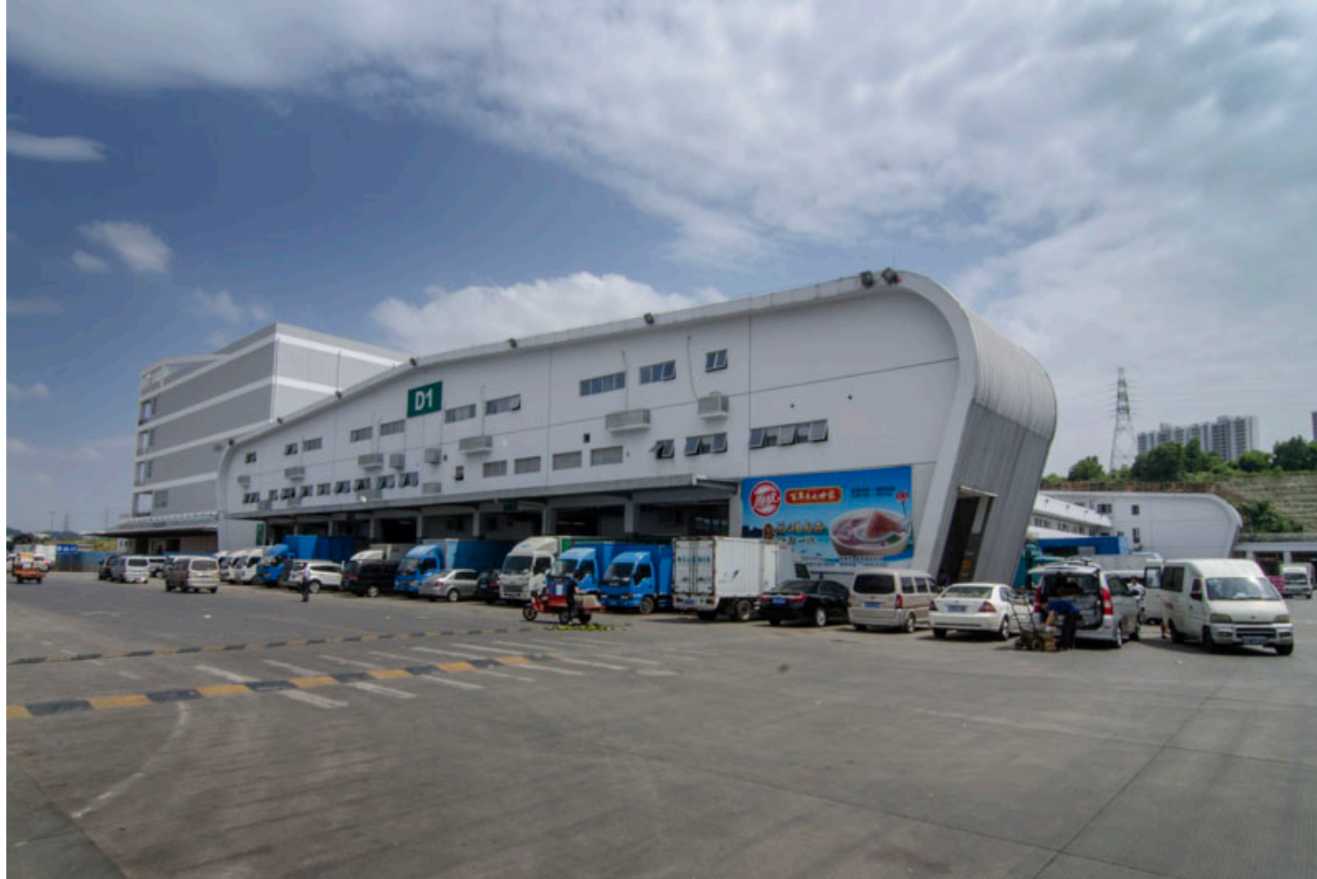
6 Networks of Distribution