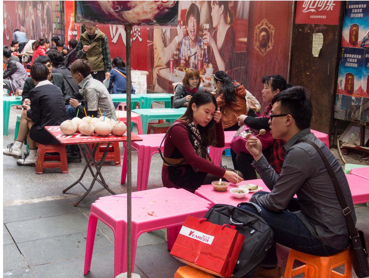
3 High and Low / Food and Urban Life / Spontaneous Design Guangzhou