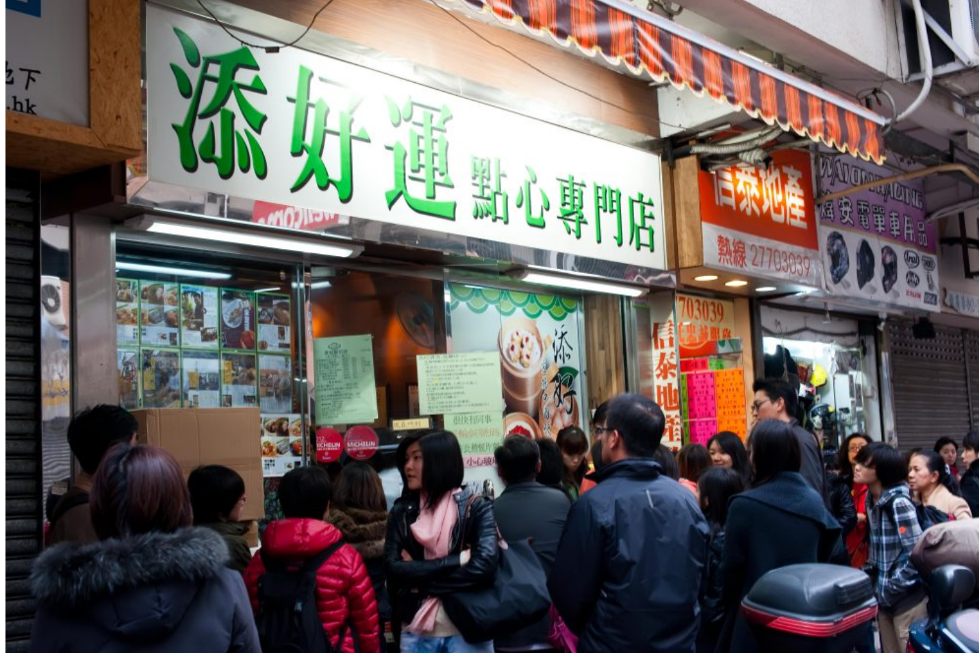
7 Networks of Consumption