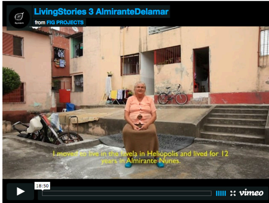
9 Research: Narrative FIG Projects, Living Stories Heliópolis . São Paulo Calling, São Paulo 2012.