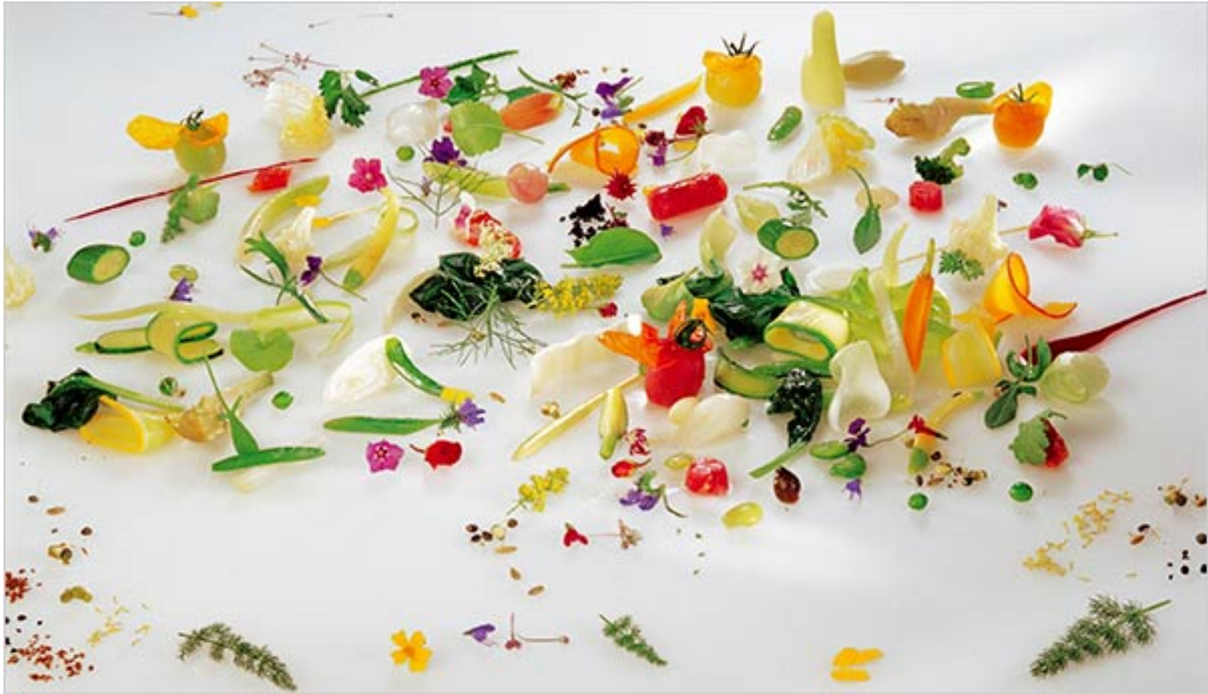
1 Food as Project Michel Bras, Le gargouillou de jeunes légumes