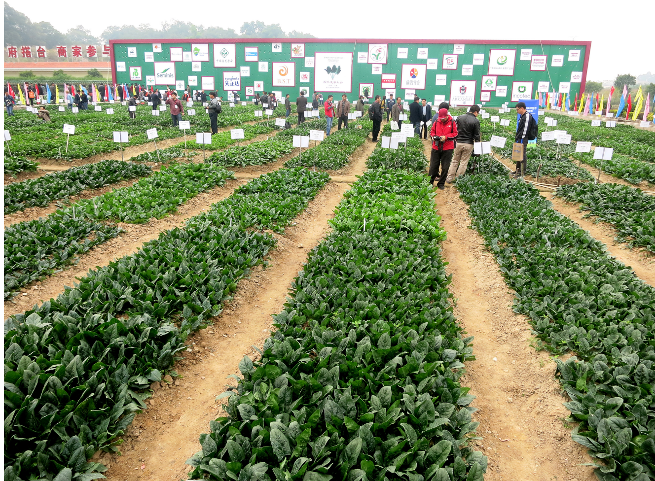
5 Networks of Production