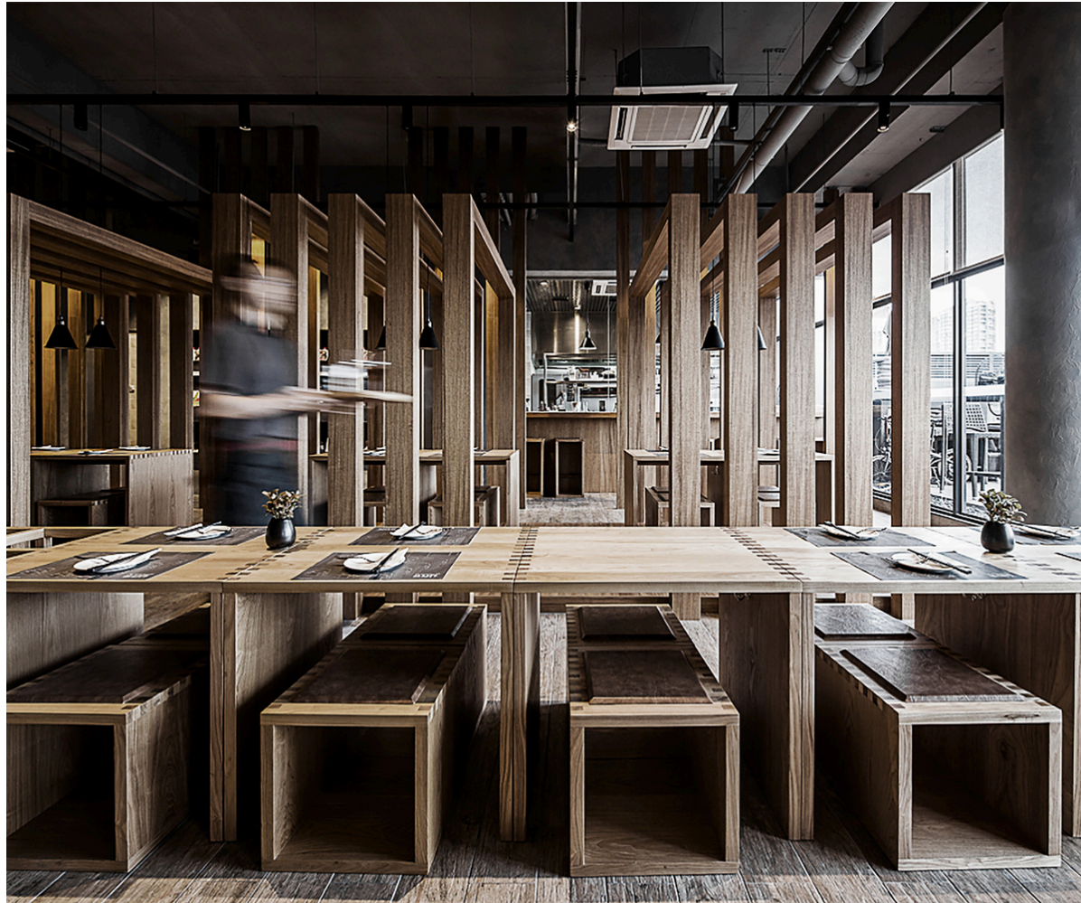
2 Food as Space Fanbo Zeng, fun.noodle bar, Shenzhen 2015